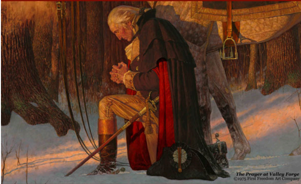
The Prayer at Valley Forge

SEEKING HIM IN ALL GENERATIONS 1 CHRONICLES 16:24 NASB THURSDAY, MAY 7, 2026